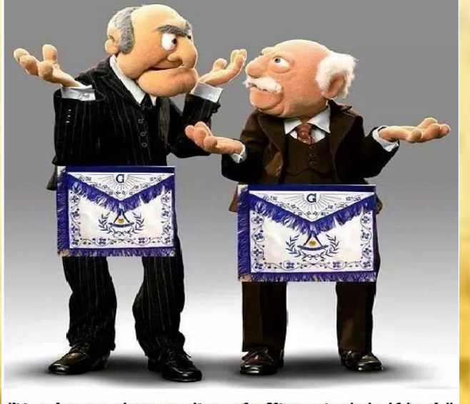
"You know, the new line of officers isn't half bad." "Nope, they're ALL bad!"